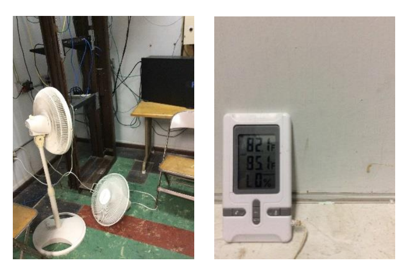
Exhibit 5B-11 Current Server Room Environmental Controls

The physical environment is not optimal in some districts' data centers. Some are located in a small closet without any climate control for temperature or humidity. Portable fans had been placed in the room to help with cooling ( Exhibit 5B-11 ).