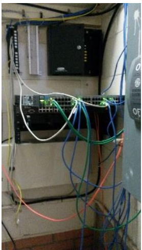
Exhibit 5B-10 Examples of No UPS Available